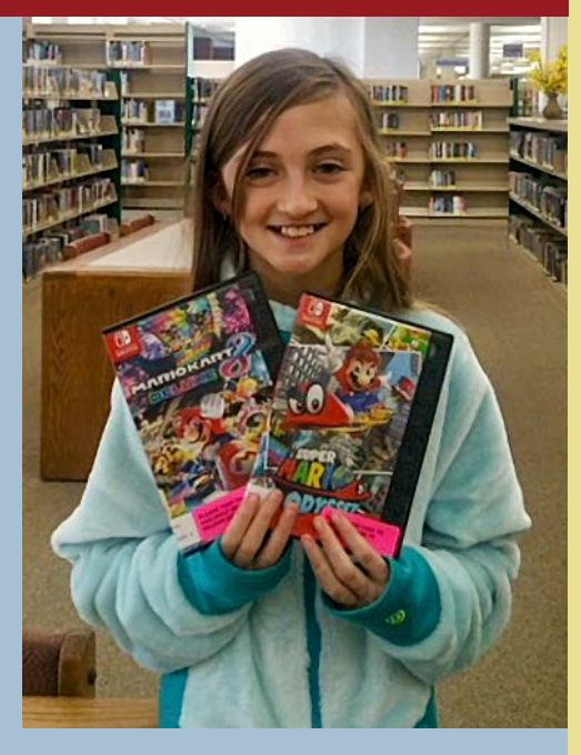
search. The games can be checked out for 2 weeks, with a limit of 2 games per card.

To find the games in our online catalog, choose "software and video games" as a format in a basic